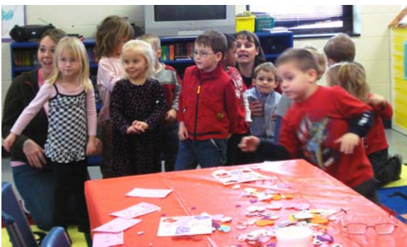
The children sing to the guests; "I'm a Valentine for you".