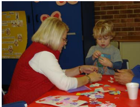
CJ and Grandma share a fun time together!