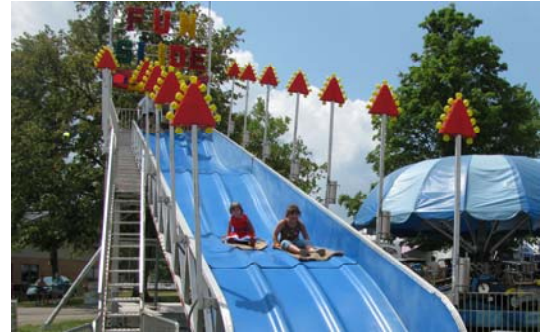
Fair Food, Fun, Rides, Tractors, Animals! WAHOO!

With summer just around the corner, plans for fun are being made now for the Wilma Valentine Creative Learning Center. The daycare will be venturing off-site for field trips, swim days, picnics in the park, visits to the county fairs, playground time, and more. We have openings for the daycare summer session (age 3-kindergarten). Give us a call at 498-4566 if you are interested!