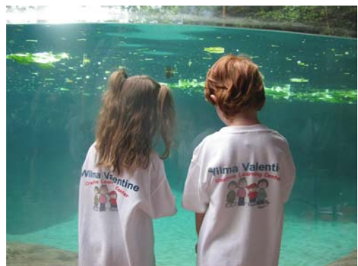
We will visit the Columbus Zoo and get to take our time seeing all the animals!