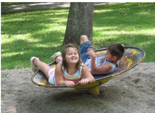
The kids will enjoy visiting the Area Metro Parks and the picnic lunches!